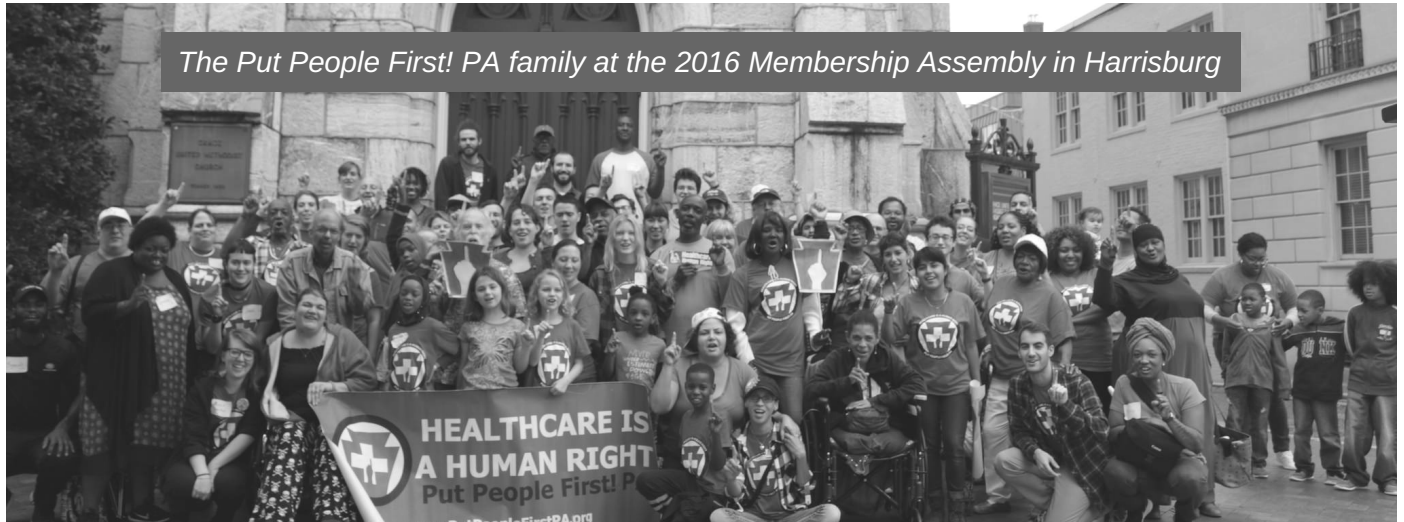
The Put People First! PA family at the 2016 Membership Assembly in Harrisburg

A NEWSLETTER BY THE MEMBERS OF PUT PEOPLE FIRST! PENNSYLVANIA