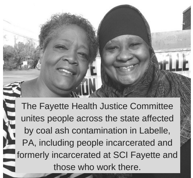
The Fayette Health Justice Committee unites people across the state affected by coal ash contamination in Labelle, PA, including people incarcerated and formerly incarcerated at SCI Fayette and those who work there.