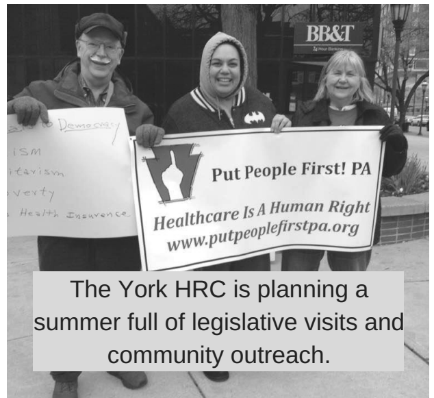
The York HRC is planning a summer full of legislative visits and community outreach.