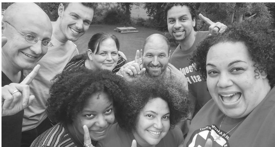
Mother Jones Leaders and Mentors from across the state at the MJLP annual retreat.

The Mother Jones Leadership Program is for leaders who are committed to uniting poor and dispossessed people in their communities, all across our state, and beyond. It involves six months of financial support, mentorship, study, skills development, and organizing - all directed at helping these leaders bring our organization to the next level.